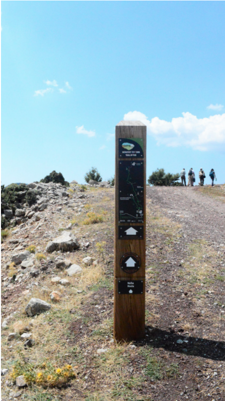
Trailhead sign for the Trail of Pan from an area near Ano Karyes in Arcadia towards Neda in Messinia.