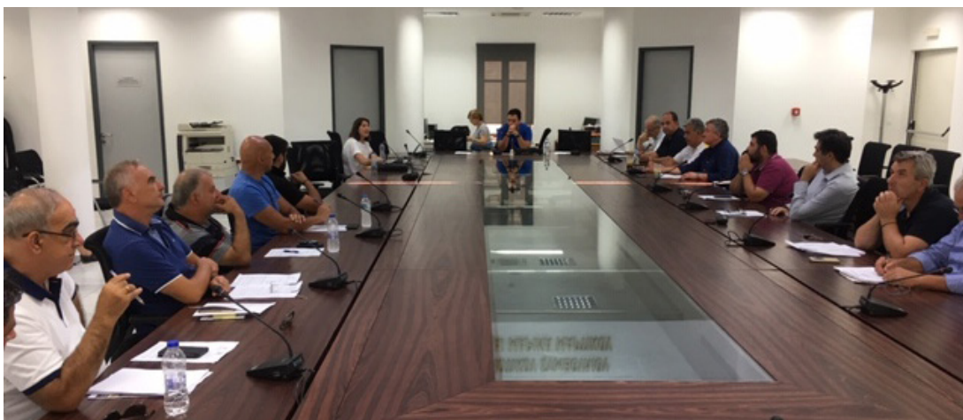
City Council of Megalopolis, August 10, 2018.