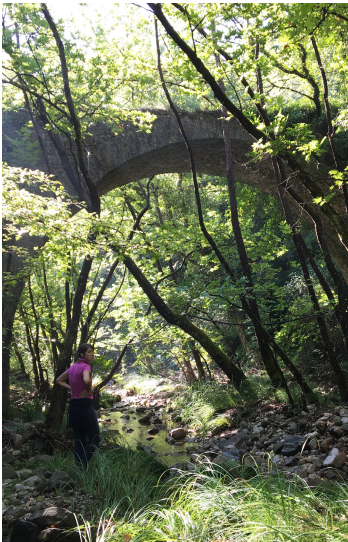
Nota Pantzou at the Boutouna Bridge near Lykaio