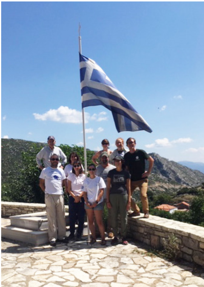
Parrhasian Heritage Park Field School 2018 in Ano Karyes.