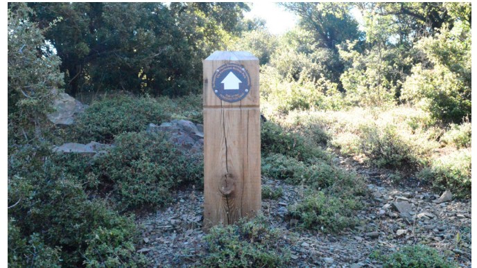
Way finding sign at the Sanctuary of Pan at Berekla

Most of the effort of the Field School this year was devoted to the installation of wooden way-finding and trail-head signs on the Trail of Pan, between the Arcadian village of Ano Karyes and the Messenian village of Neda and to affixing new metal signs to the wooden posts. This work included installation of posts and signs in the area of the Temple of Pan at Berekla. It is now possible for tourists and hikers to walk between the two villages as well as to the site of the Temple of Pan, near the village of Neda, with clear signs and instruction.