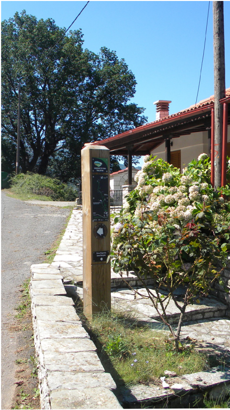
Trail of Pan trailhead sign in Neda