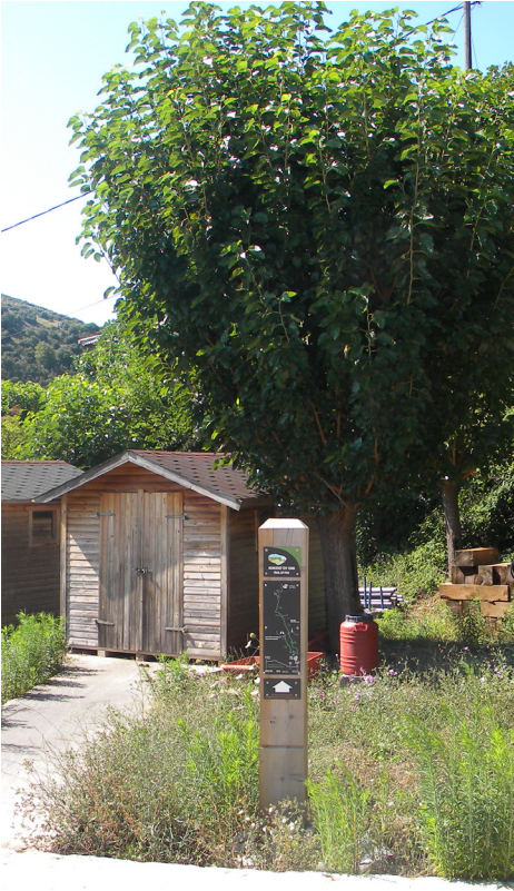
Trail of Pan trailhead sign in Ano Karyes